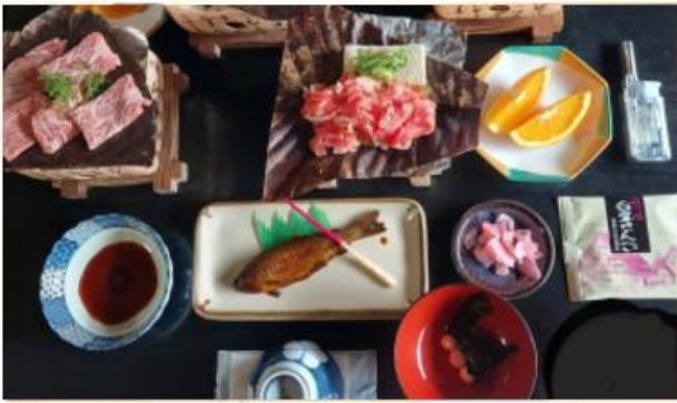
HIDA BEEF FULL MEAL SET 飛騨牛満腹御膳