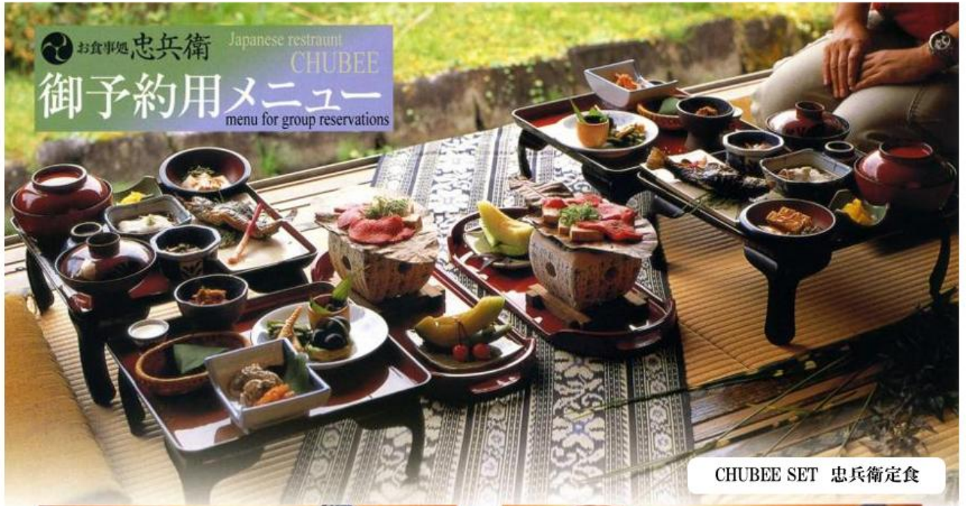
CHUBEE SET 忠兵衛定食