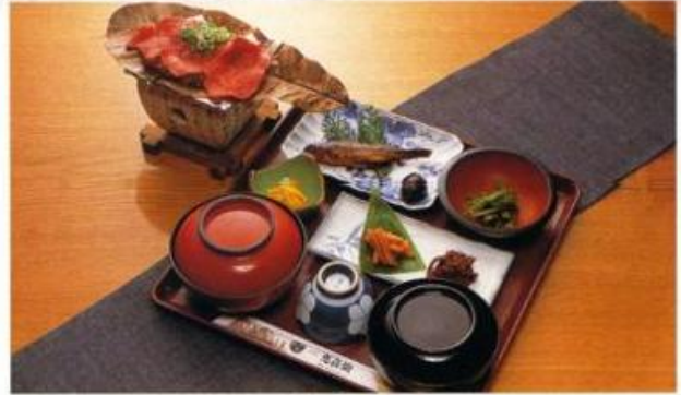
GRILED WAGYU WITH MISO SET 和牛肉味噌御膳