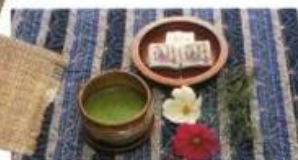
GREEN TEA 抹茶