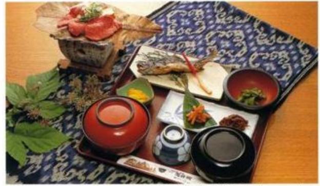
SHIRAKAWA-GO SET 白川郷定食[肉増量コース]