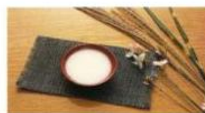
NIGORI ZAKE にごり酒