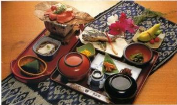
GASHO SET 合掌定食